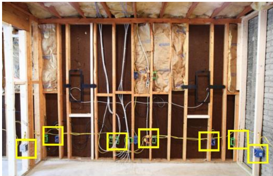
Circuit Breaker Box

There are many outlets tied to a circuit breaker. Do not plug in both extension cords to two different outlets on the SAME circuit breaker. They must EACH be on a separate DEDICATED circuit breaker.